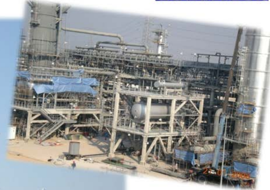
ATC Reformer & Aromatic Complex II Project SKEC (Thai)