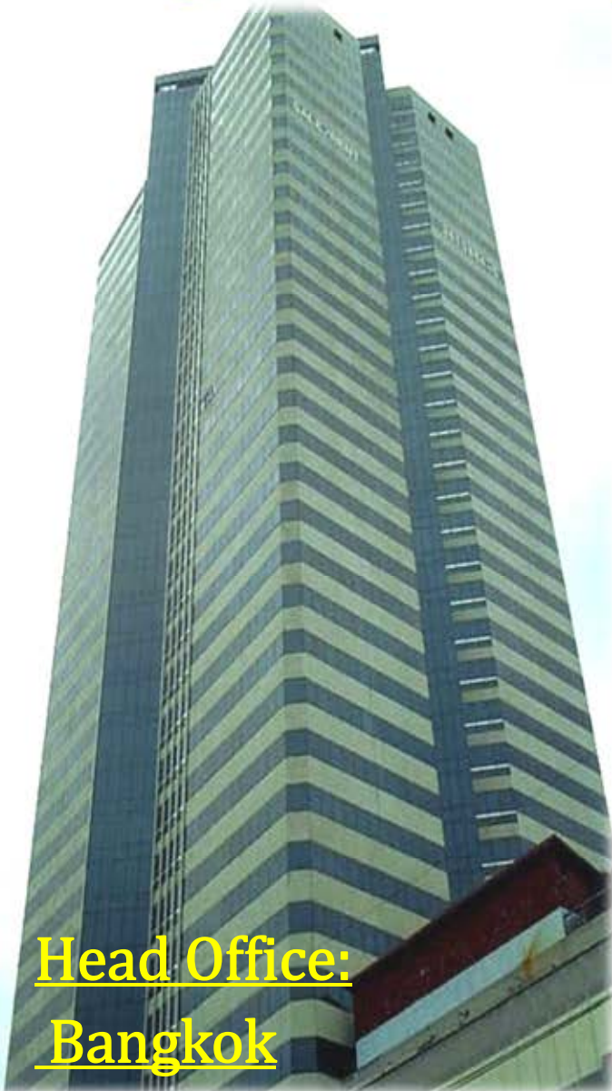
Head Office: Bangkok