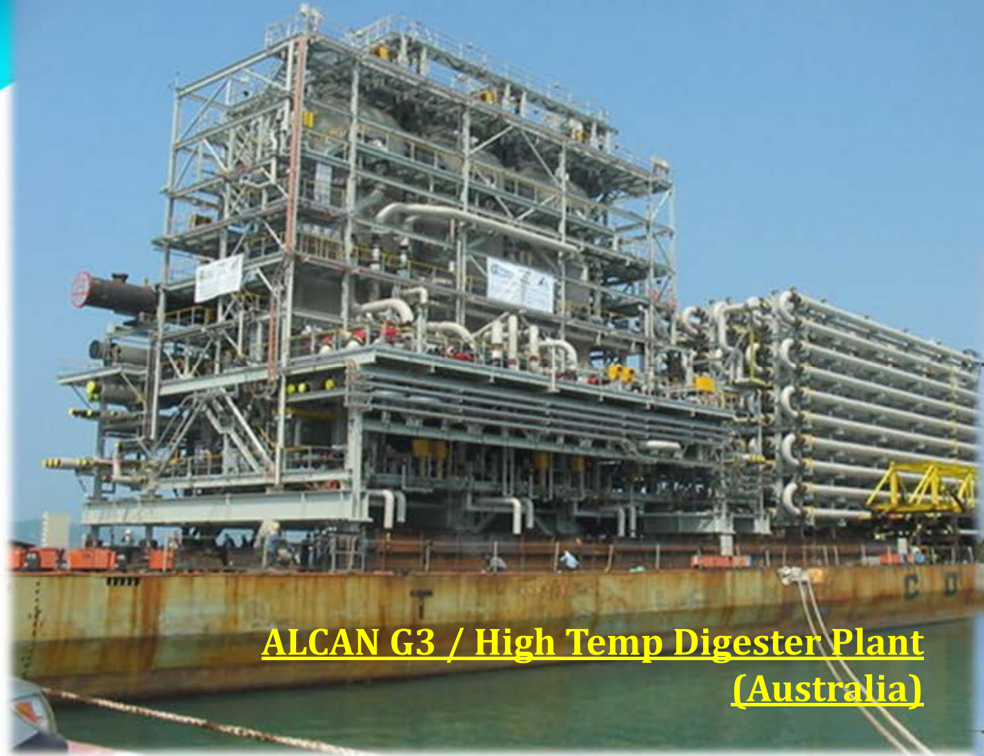
ALCAN G3 / High Temp Digester Plant (Australia)