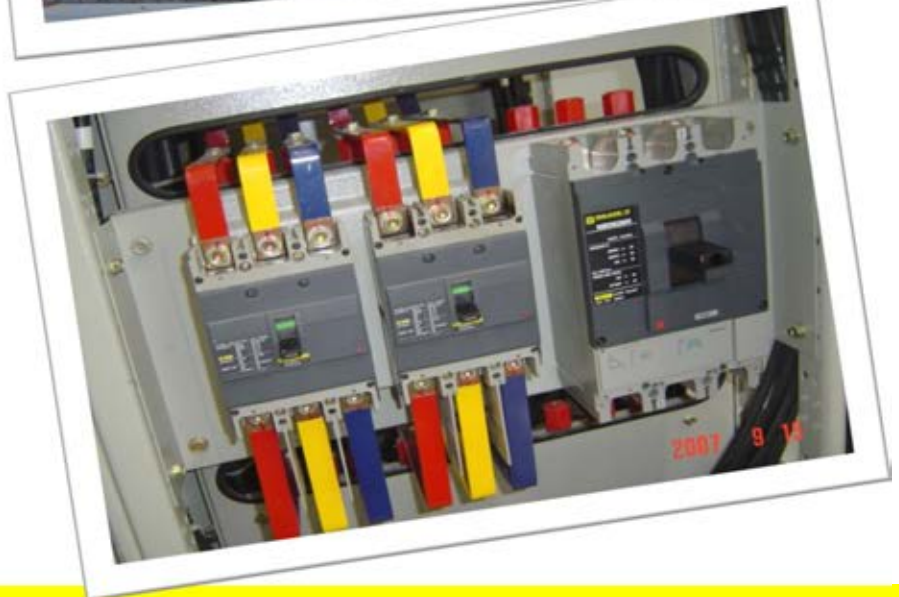
National Starch HVPU and POPIT Project