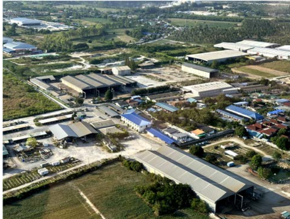
RAYONG Facility (Area)