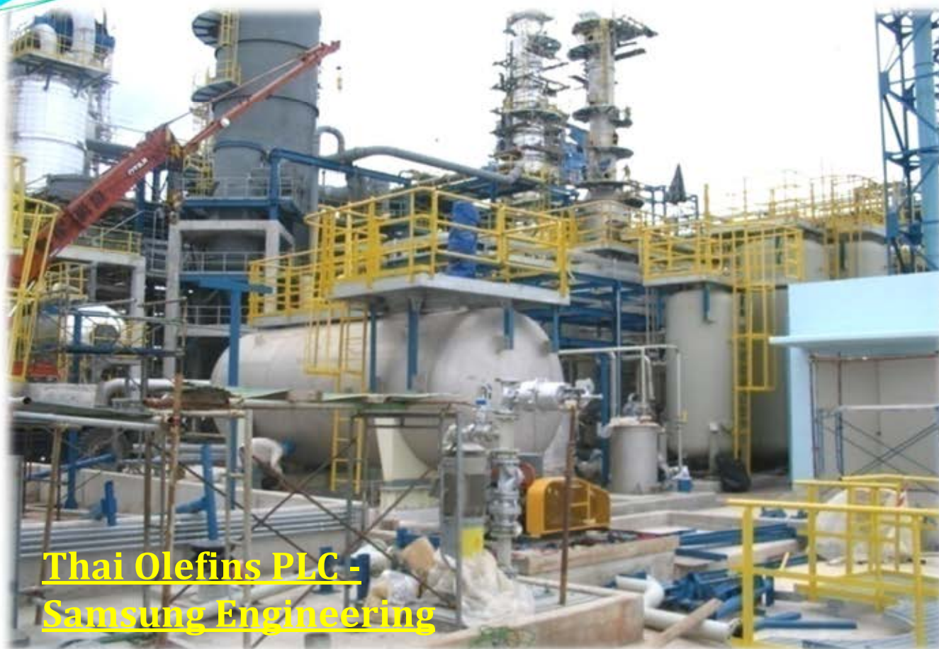
Thai Olefins PLC - Samsung Engineering