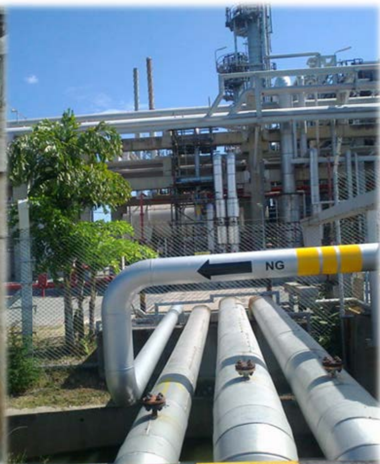
Thai Lube Base Public Company Limited. NG Pipeline Installation for VDU & Hot Oil Heaters Project