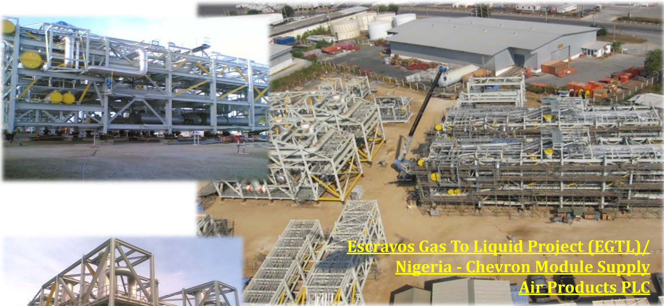
Escravos Gas To Liquid Project (EGTL)/ Nigeria - Chevron Module Supply Air Products PLC